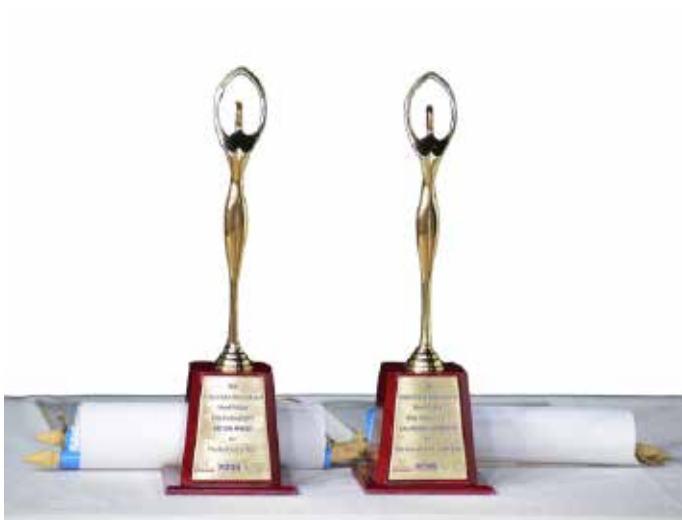
PATTON AWARD for the Best Indian Film KALPANIRJHAR AWARD for the Second Best Indian Film